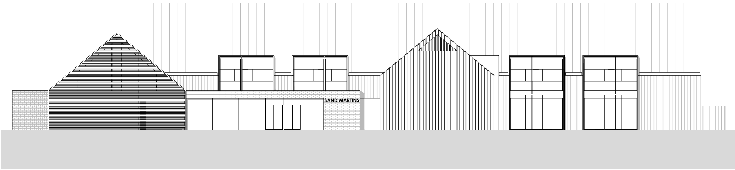
ELEVATION 1 - EAST

ROOF FRL +70.91 ROOF FRL +67.874 FIRST FFL +62.0 GROUND UCL +60.8 GROUND FFL +58.0